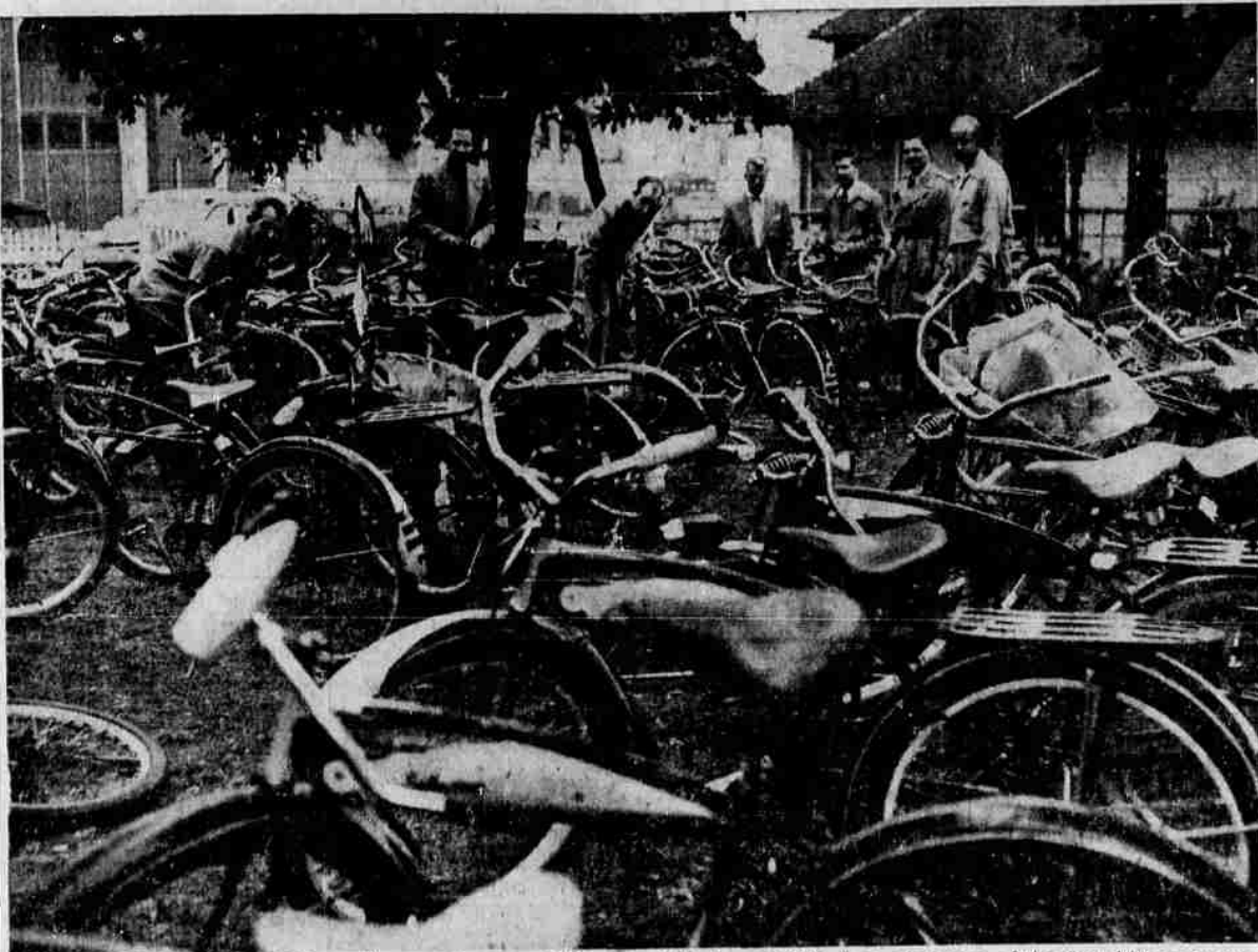
MAKING KIDS' BIKES SAFE at night was the aim of Roseburg Active Clubbers Saturday when they secured luminous Scotchlite tape to fenders of 322 bicycles. Just a small portion of the bikes are shown here in the city park across from the Elks Temple. Shown at work on bikes are, left to

All Bureau of Land Management lands will be open to logging and hunting effective at noon today, according to a telegram received in the local BLM office in Roseburg today.