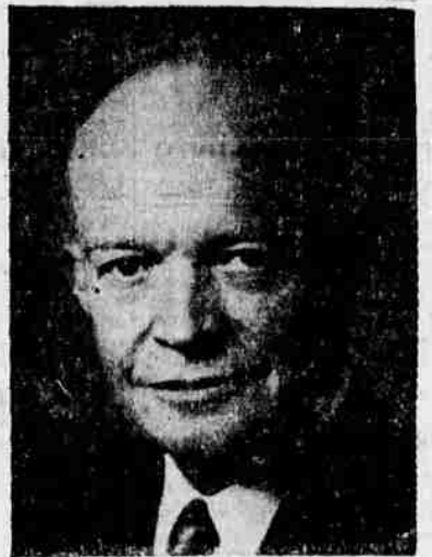
Adlai E. Stevenson

"Americans who fail to register and go to the polls actually are voting by default for minority rule. Let no one forget that in every instance in which totalitarian rulers have seized power they have done so with minority rather than majority support. I wish every success to The National Non-Partisan Register and Vote Campaign."