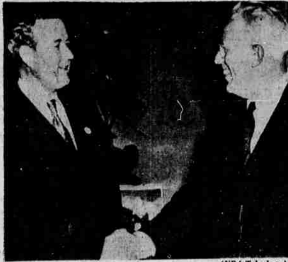
GIVES IKE "ME-TOO" LABEL —Democratic Vice-Presidential nominee John Sparkman (left) is greeted by Governor Earl Warren in Sacramento, Calif. In a speech later in the evening, the Alabama senator said Dwight D. Eisenhower has "gone even better than a me-too campaign." He also denounced Senator Richard M. Nixon, Republican vice-presidential nominee, for voting against the Central Valley Project.