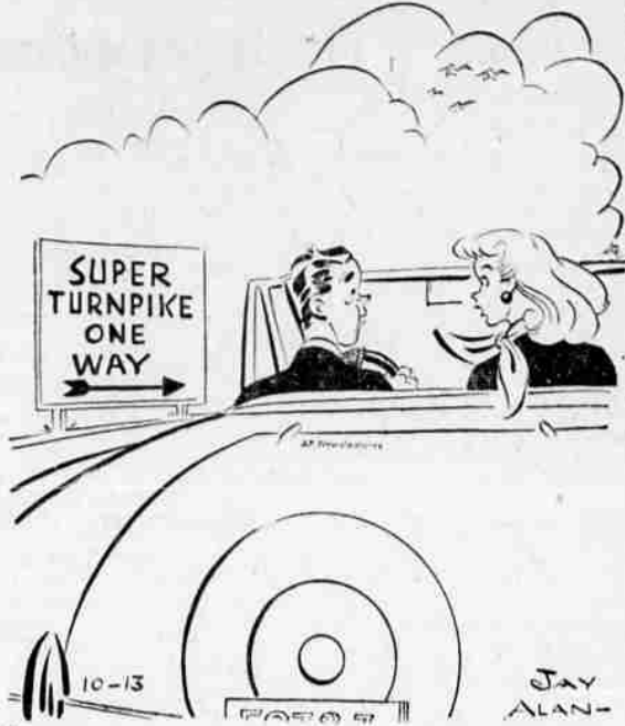
BUT IF IT'S JUST A ONE WAY ROAD, HOW IN THE WORLD DO WE GET BACK?

Trademark Registered U. S. Patent Office