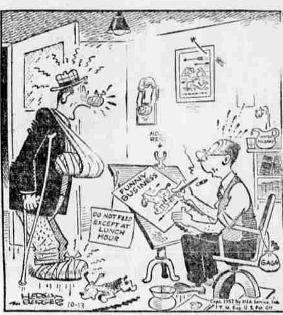
"I tried out one of the gags in your cartoons and it didn't work!"