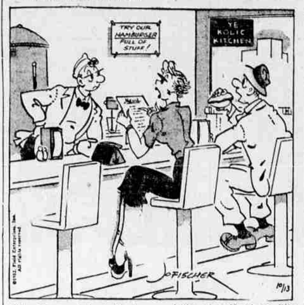
Alphabet soup today? Goodness, no! Not after I've been filing letters all morning!