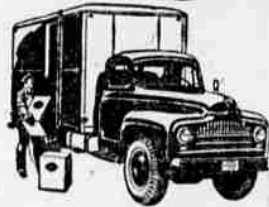
For bulky loads! The medium-duty L-160 series with van body means ease of handling and exceptional cab comfort. GVW's 14,000 to 16,000 lbs.