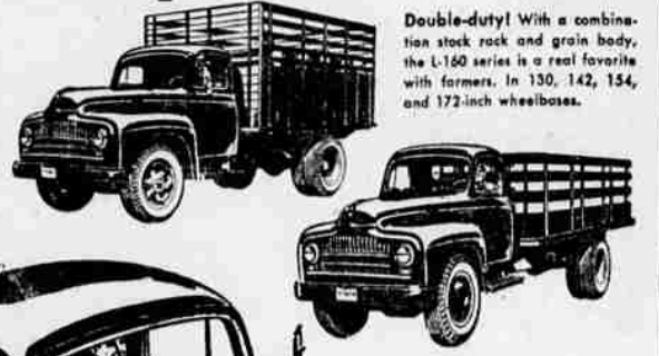
Double-duty! With a combination stake bed and grain body, the L-160 series is a real favorite with farmers. In 130, 142, 154, and 172-inch wheelbases.

Because International offers a complete range of medium-duty models, you're bound to find "the one" best suited for your job. This means extra years of service, big savings on gas and oil, remarkably low maintenance costs. These are just a few of the reasons why you should consider an International. Come in and get the whole story.