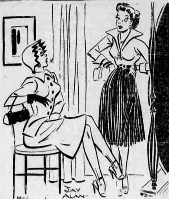
MY DEAR, IT LOOKS WONDERFUL ON YOU... UNFORTUNATELY!