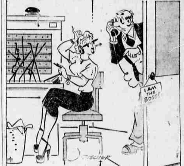
I don't give you all wrong numbers, Mr. Wump. Your incoming calls are usually right.