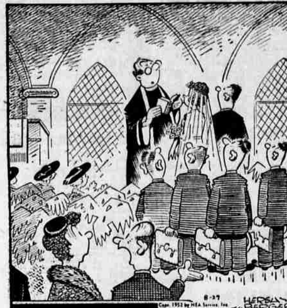
"They're creditors—they found out he's marrying money!"