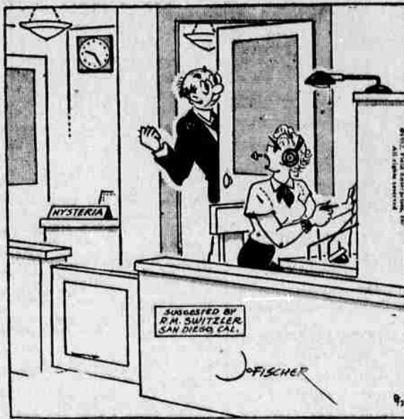
Hysteria is practically here, Mr. Wump. Her mother said she should be waking up any minute now.