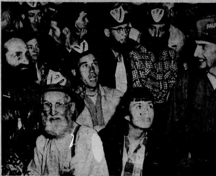
SHADES OF THE PAST — This could be 1852. However it happened to be the modern era of beard growing in connection with the Douglas County Centennial. Various expressions appear among contestants while one of their fellow contestants is judged. Girl in center foreground appears to be just admiring.

Eisenhower And Nixon March Mith Legionnaires NEW YORK (AP) — Thousands swung up fifth avenue Tuesday in the American Legion's massive display of the nation's past and present military might. The parade of more than 75,000, expected to last at least 12 hours, stepped out from 31st St. at 6 a.m. (PST). Its terminus was 43 blocks north of 74th St. Marching with many a former buck private was a five-star general, Dwight D. Eisenhower. The Republican presidential candidate strode at the head of the Kansas contingent. His vice-presidential running mate, Sen. Richard M. Nixon, marched with the California delegation from his home state.