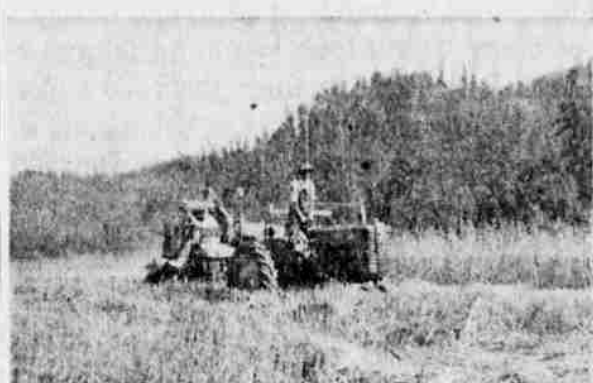
HARVESTING TEST WHEAT — Roy V. Matthews, Days Creek farmer who has been co-operating with the Douglas County Extension Agent's office in running grain fertilizer trials, combines his test crop of fall-sown wheat. Value of the increased yield in fertilized over unfertilized plots ran as high as 27 bushels per acre. From 25 to 30 acres of wheat were sown in the tests.