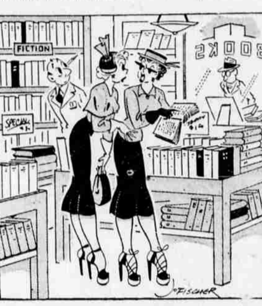
I Don't Care Much For Murder Mysteries, Coma. Someone Always Gets Killed.