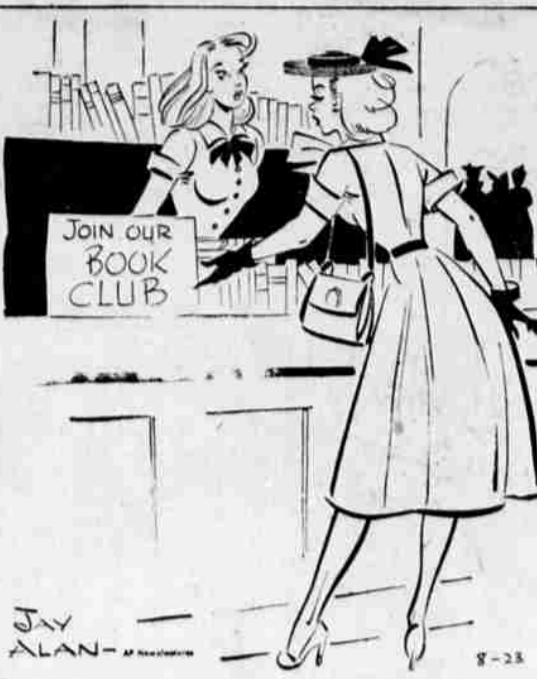
"I MIGHT BE INTERESTED IF YOU HAD A BOY OF THE MONTH CLUB!"