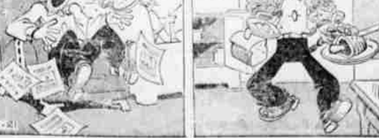
MAYBE ITS' FEED A FEVER AND STARVE A COLD