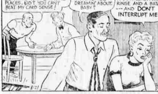
SO WHAT'S WITH CHANGING PLACES, KID? YOU CAN'T BEAT MY CARD SENSE!