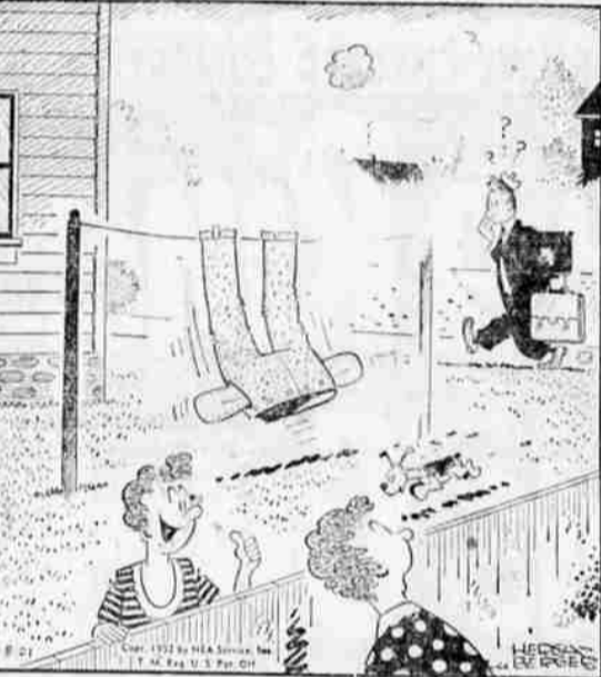
"I keep 'em on the line with the pockets turned out—it keeps collectors away!"