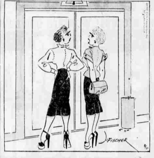
Some Days My Mind Is So Full, Hysteria, It's Just Completely Blank