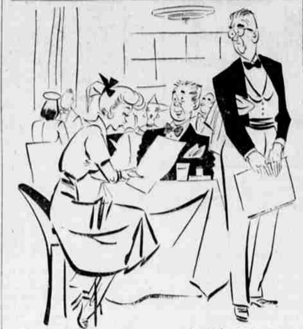
8-21 "YOU ORDER FIRST, DEAR, THEN I'LL KNOW JUST HOW MUCH I CAN'T AFFORD TO EAT!"