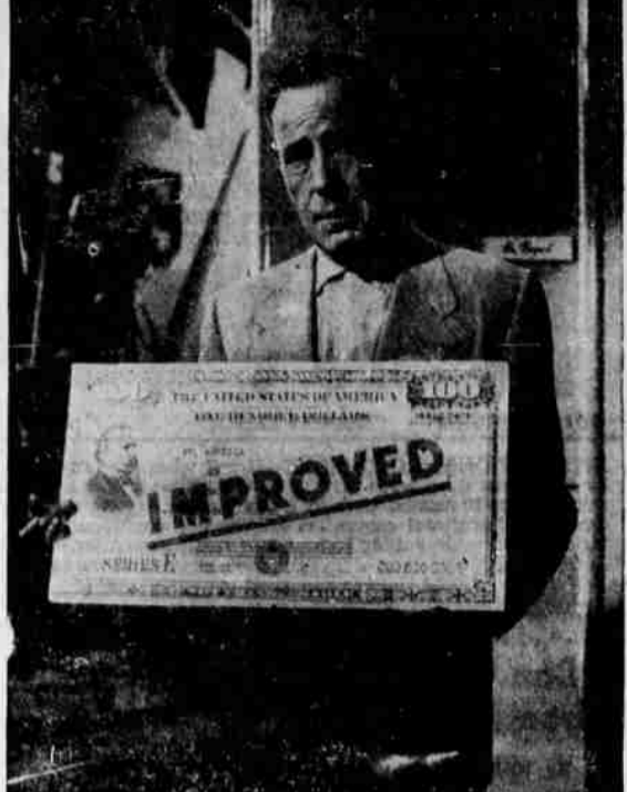
Humphrey Bogart, Academy Award winner, in a special motion picture trailer produced by Metro-Goldwyn-Mayer Studios, urges moviegoers in 18,000 motion picture theatres throughout the country to invest more in Series E United States Defense Bonds. The special Bogart trailer is the first of a series of releases by the five major newsreel companies as a contribution to the current Defense Bond campaign. Bogart was selected as the first top star personality in a series in which stars will speak up for Defense Bonds from motion picture screens at bi-monthly intervals during the year.