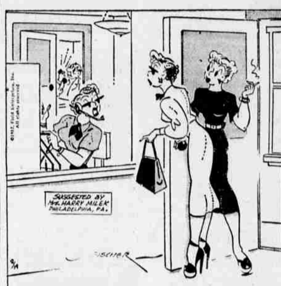
I'll Meet You Downstairs, Girls. Mr. Wump Is Talking To His Wife And I Promised I'd Cut Him Off In Three Minutes.