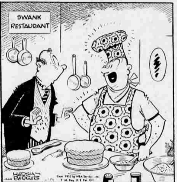
"Why not? I'm just keeping up with the fancy shirts they wear these days!"