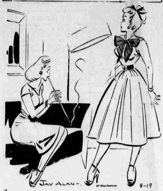
IT'S A SUPER KING SIZE CIGARETTE I INVENTED!