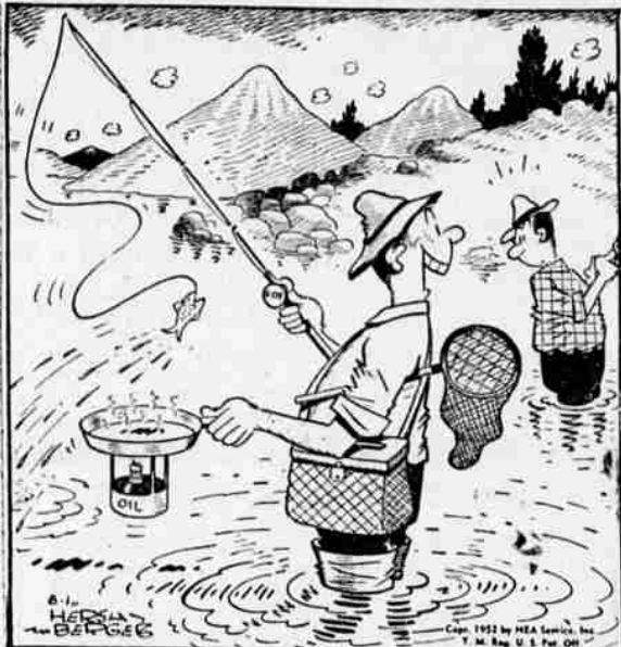
"Now I don't have to wait to get back to camp to taste my first trout!"