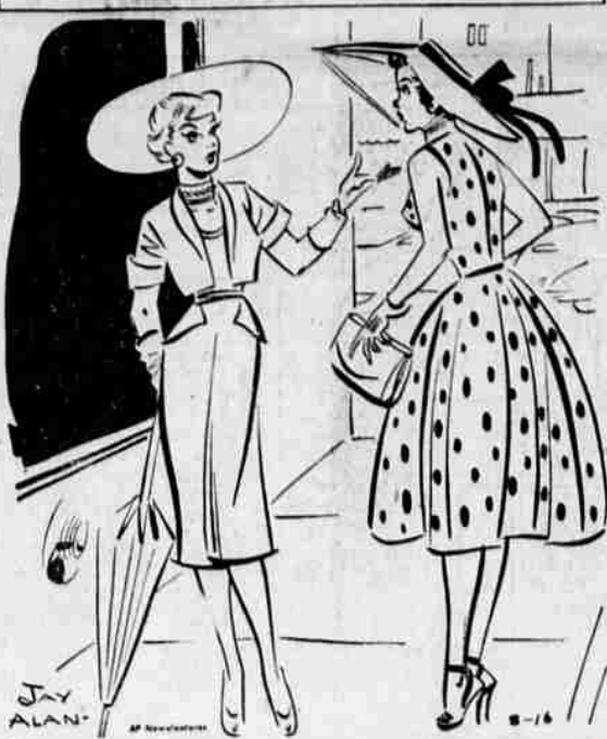
HE BROUGHT ME A MINK COAT ONCE BUT THERE WAS A BLONDE IN IT!