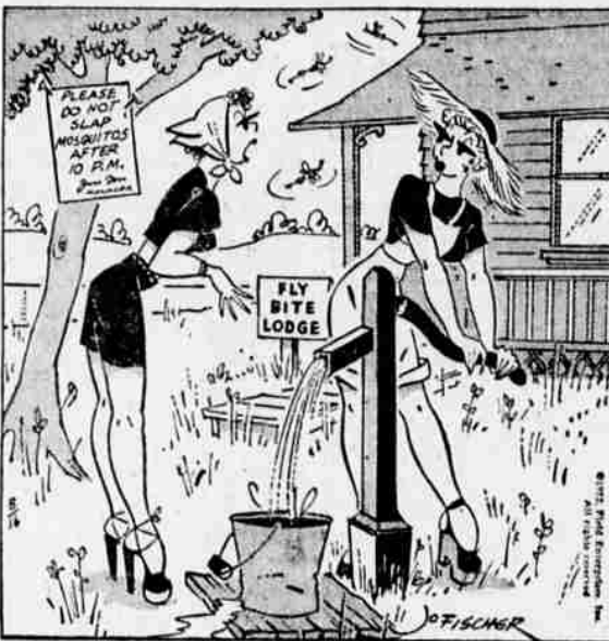
Gosh, Deteria, this vacation is so peaceful... so quiet... so relaxing... it's driving me crazy!