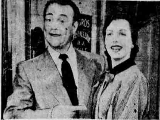
RED SKELTON explains ANN MILLER, in this comedy scene from MGM's "LOVELY TO LOOK AT," in color by Technicolor.