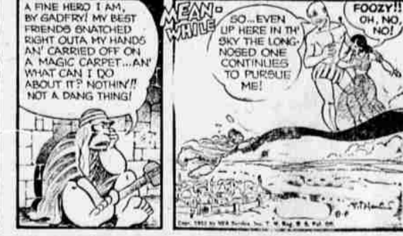
FOOZY!! OH, NO! GO... EVEN UP HERE IN THE SKY THE LONG-NOSED ONE CONTINUES TO PURSUE ME!