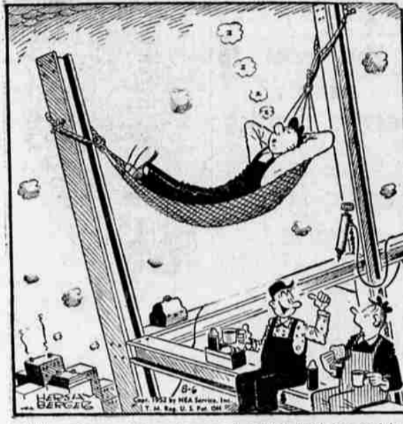
"His wife gave him a hammock for his birthday and he likes to use it during the lunch hour!"