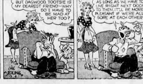
BUT DAGWOOD TOOTSIE IS MY DEAREST FRIEND—WHY DO I HAVE TO BE MAD AT HER TOO?