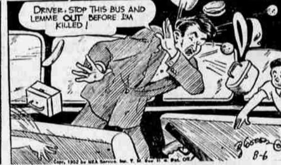
DRIVER, STOP THIS BUS AND LET ME GET OUT BEFORE I'M KILLED!