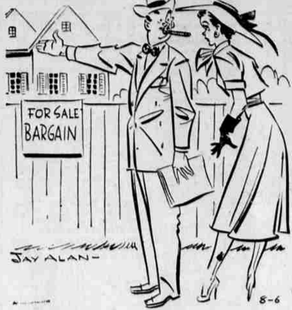
NO IT DOESN'T HAVE A ROOF, BUT ON THE OTHER HAND IT'S ECONOMICAL—NO OVERHEAD!