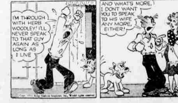
IM THROUGH WITH HERB WOODEY! I'LL NEVER SPEAK TO THAT GUY AGAIN AS LONG AS I LIVE!