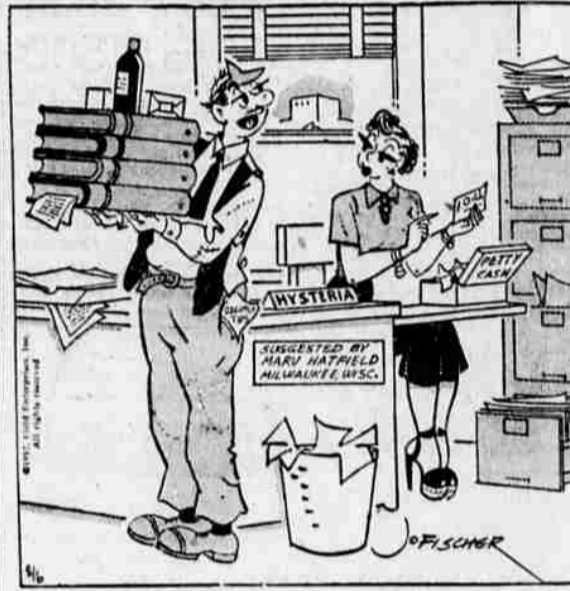
Sure, it's my I.O.U. and it's as good as the day I wrote it . . . two years ago