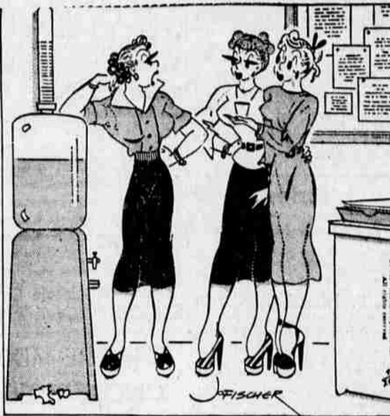
Angora is getting awfully absent minded. She started to tell me some gossip about myself today.