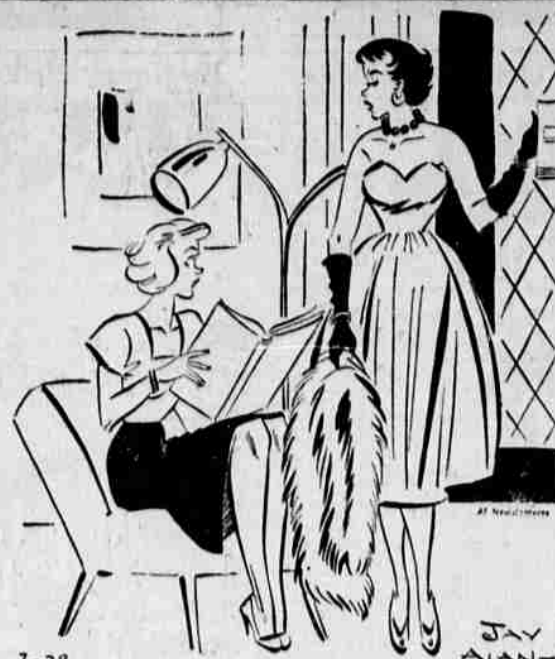
7-29 "YOU WON'T CATCH ME GOING TO DINNER WITH HIM AGAIN, HE'S A LADY KILLER—HE STARVES THEM TO DEATH!"