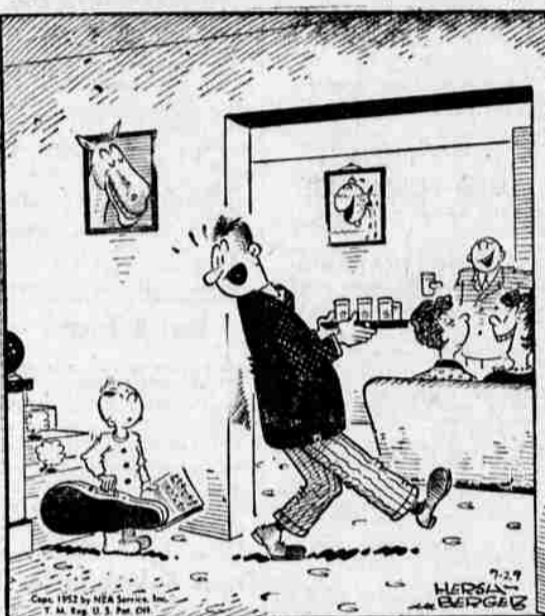
"Come on in and play your fiddle—I can't get our guests to go home!"