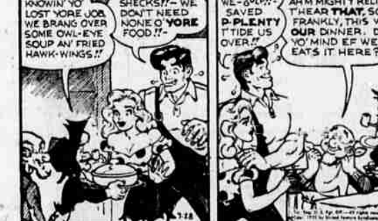
KNOWIN' YO LOST YOURE JOE WE BRANG OVER SOME OWL-EYE SOUP AN' FRIED HAWK-WINGS!! SHECKS!!—WE DON'T NEED NONE O' YOURE FOOD!!— WE—GUP??—AH'M MIGHTY RELIEVED T'HEAR THAT, SON! T'HEAR THAT, SON! T'HEAR THAT, SON! T'HEAR THAT, SON! T'HEAR THAT, SON!