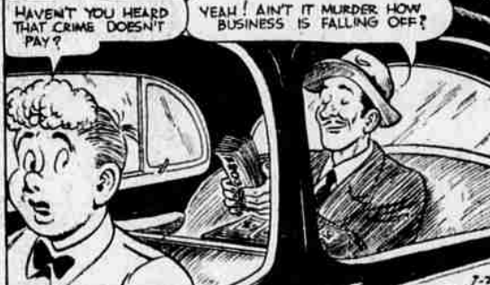
HAVENT' YOU HEARD THAT CRIME DOESN'T PAY? YEAH! AIN'T IT MURDER HOW BUSINESS IS FALLING OFF?