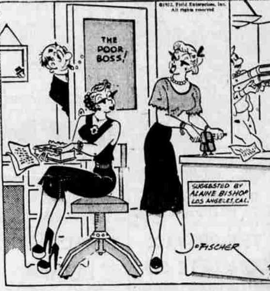
I believe responsibility agrees with me, Hysteria. I'm learning to forget more and more important stuff.