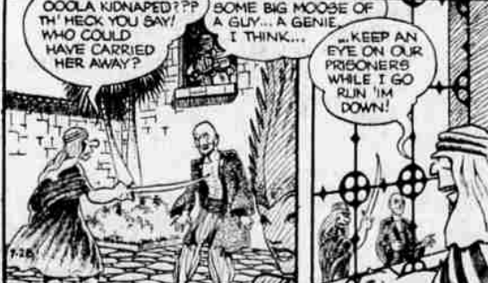
OOOLA KIDNAPED?? TH' HECK YOU SAY! WHO COULD HAVE CARRIED HER AWAY? SOME BIG MOOSE OF A GUY. A GENIE, I THINK... KEEP AN EYE ON OUR PRISONERS WHILE I GO RUN 'EM DOWN!