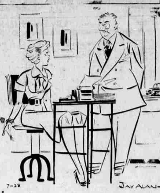
I KNOW I'VE ONLY WORKED HERE A YEAR BUT I WANT MY RAISE RETROACTIVE TWO YEARS, I WASN'T MAKING ENOUGH BEFORE I CAME HERE EITHER!