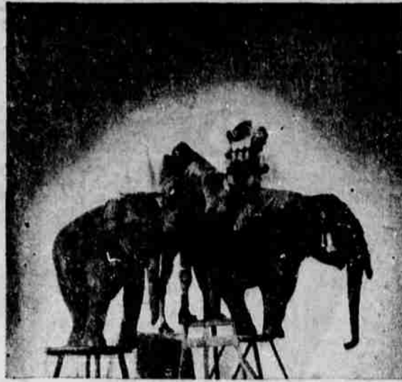
FREE ATTRACTION at the West Coast Shows opening July 22 at the Fairgrounds in Roseburg for six days is the nightly appearance of the camel "Mose," two elephants, Shipwreck Rose and Baby Tribby, and the famous pony, Tony, under sponsorship of the American Legion Umpqua Post No. 16.