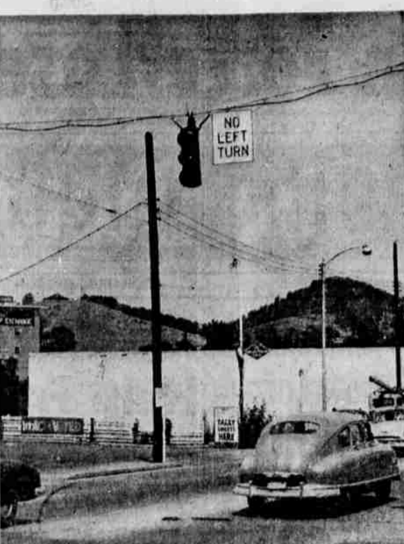
NO LEFT TURN—At last! The evening rat race along Stephens Street is ended. State Highway Department crews have erected a permanent "no left turn" sign at Oak and Stephens Streets. Previously, temporary signs were put up during the day but were removed in the evening hours. This has, on occasions, confused motorists.