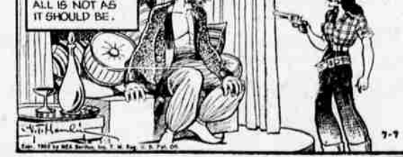
WHILE OOP AND FOOZY REST AFTER A HECTIC BIT OF ADVENTURING, COOLA SET OUT TO CUT HERSELF IN ON SOME OF THE WEALTH OF THE QUEEN OF SHEBA.