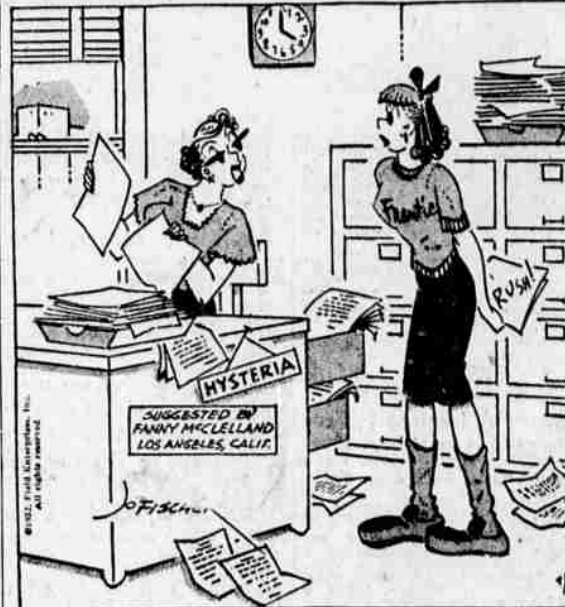
I always plan my work the day before, Frantic. That gives me more time to avoid it the next day.