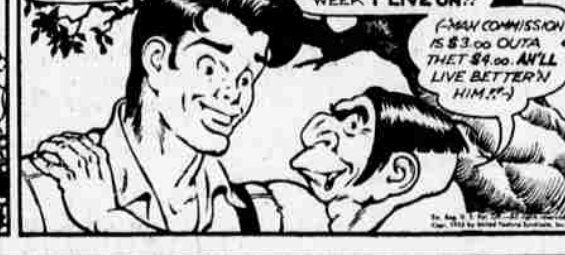
NOW THAT YOU'RE A CRESCENT MAN, PEOPLE LOOKS UP T'YOR-YO-YO OWNS IT 'T'YOR PUBLIC T'HAVE A TELEVISION SET?