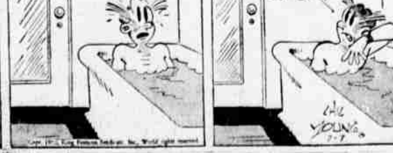
I PICKED UP YOUR WRIST WATCH AT THE JEWELERS TODAY.