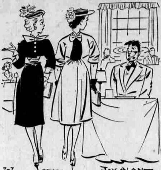
Tell me, dear, who was that nice man I just said hello to?