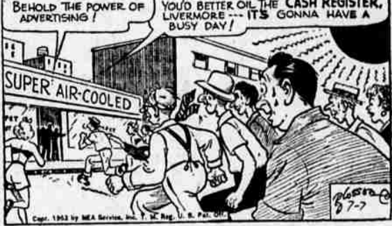
THAT SHE BLOWS GENTS! YOU CAN START NAILING UP THAT AIR-COOLED SIGN, LIVERMORE!