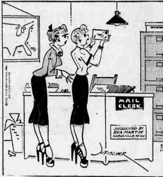
Hysteria's boy friend certainly needs a new typewriter ribbon. I can barely read it.