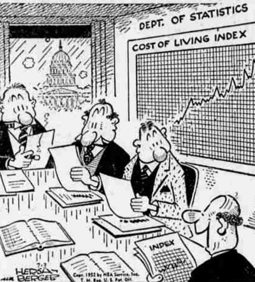
"Gentlemen, I think the simplest way to estimate the cost of living is to add 10 per cent to one's income!"