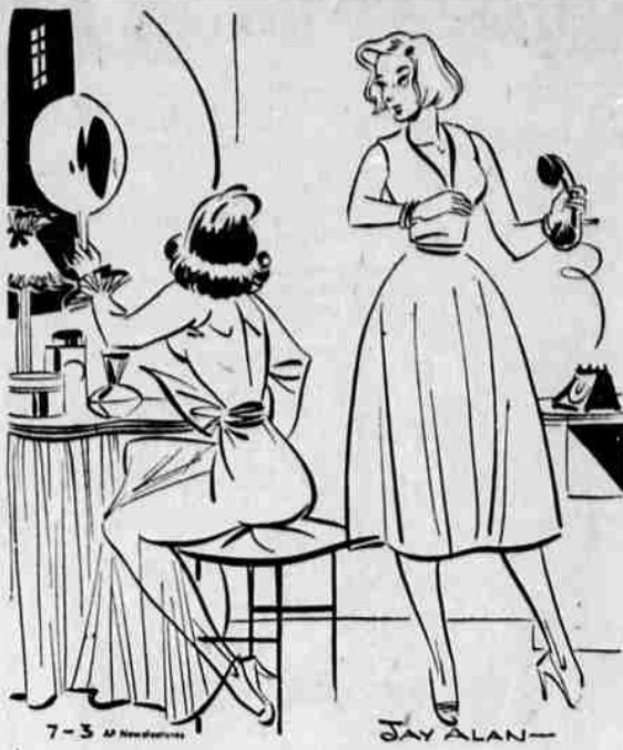
7-3 NO, HE SAYS HE DOESN'T HAVE A FRIEND. WOULD YOU BE INTERESTED IN ONE OF HIS ENEMIES?