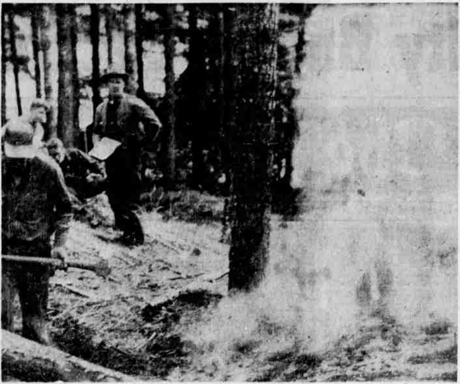
SMOKE EATERS —Forest rangers demonstrate on a mock forest fire during the Wolf Creek Camp fire school how to put fire trails around forest blazes while instructor (in background) explains operation to class.