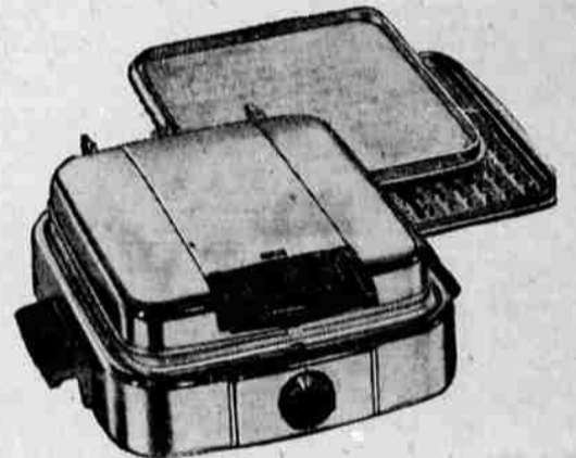
REG. 22.95 CHROMED COOKER