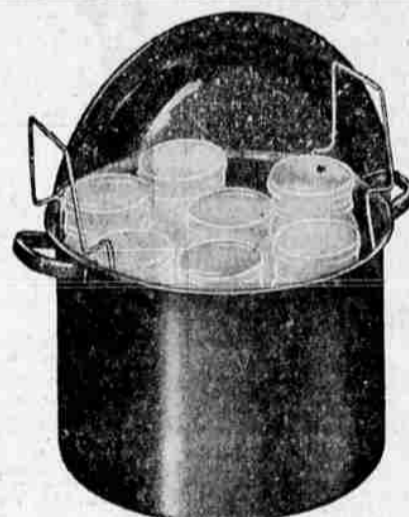
REGULAR 2-19 COLD PACK CANNER

Best quality cut 15%. Automatic—shows when to put on food, when it's done. Grids bake 4 waffles on one side, toast 4 sandwiches, grill up to 18 hamburgers, fry food on other side. Cool handles. AC.