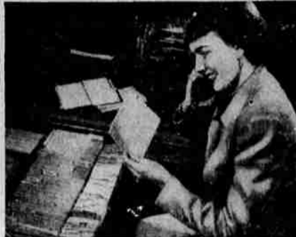
Making it pleasant for you to do business with us is the aim of our business office people who serve you.