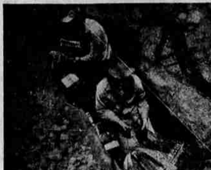
When trouble strikes, telephone men get going fast to keep your telephone always at your service.