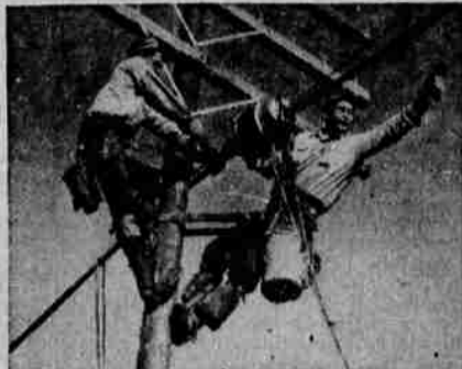
No one can guess the importance of the calls which will flow through the cable these linemen are installing.