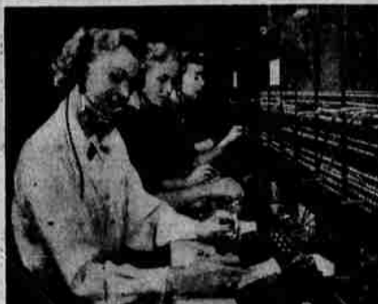
The capable hands of telephone operators are ready to put your calls through—when and where you want.