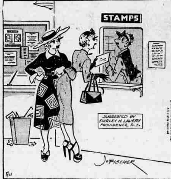
I'm not putting a stamp on this because I put one too many on a letter I mailed yesterday.