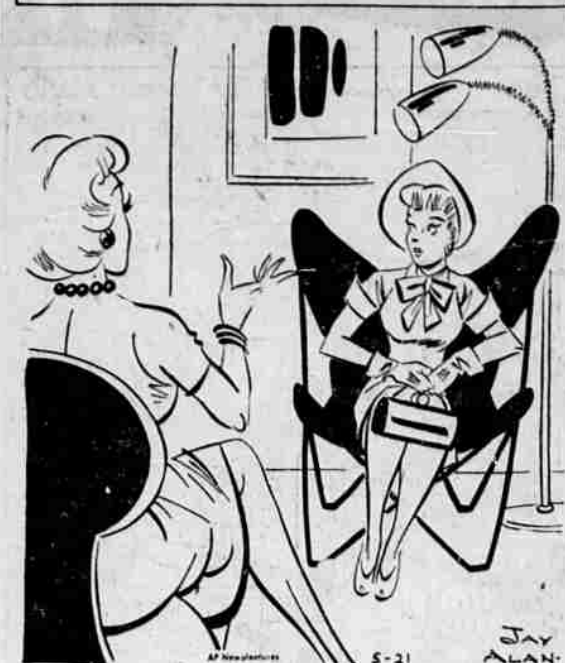
"OF COURSE JACK IS A GOOD LAWYER! HE GOT ME THE BEST DIVORCE I EVER HAD!"