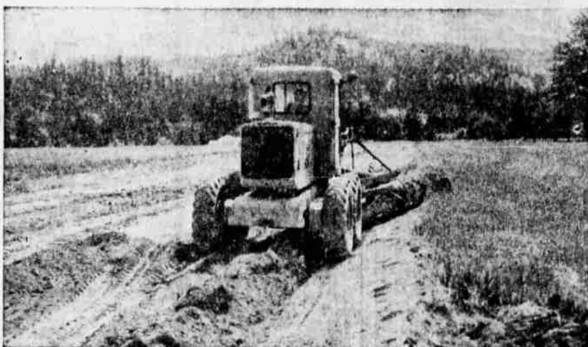
WORLD'S FASTEST DIRT-MOVER is the familiar motor grader. Here is the latest, the "Caterpillar" 100 hp. No. 12 owned by N. Fiorito Construction Co., accurately shaping a portion of the new Portland-Seattle highway near Castle Rock, Wash. 99% of all "Cat" graders produced are still in service.