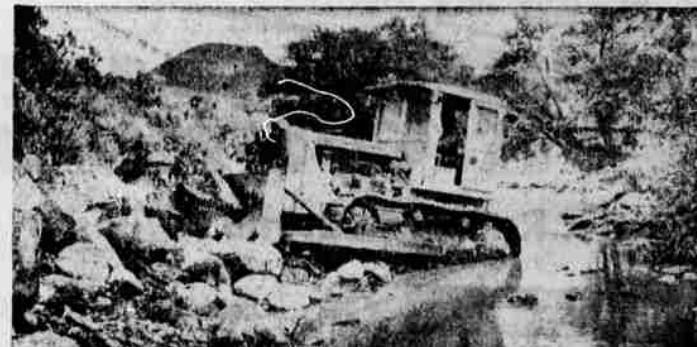
GETTING BOULDER: "Cat" D6 Diesel Tractor with "Caterpillar" 65 Bulldozer (above) scrapes rock bottom to clear creek channel for Wasco County (The Dalles) bridge crew. Interstate Tractor and Equipment Co. is "Caterpillar" distributor in this area, maintains complete parts and service facilities.