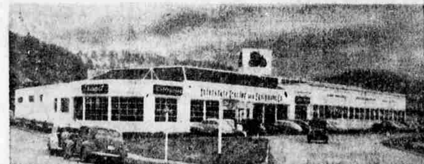
POWER PROBLEMS? Interstate Tractor and Equipment Co. is ready to help you boost production with "Caterpillar" Diesel Power, engineered for your particular application. Visit heavy equipment headquarters, 709 N. Jackson St., Roseburg. Phone 3-6621. (Paid Advertisement)