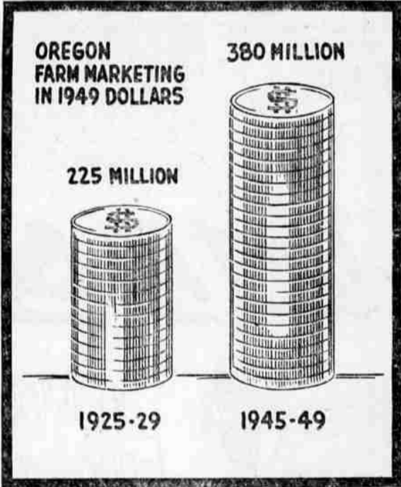
Discounting inflation, value of Oregon's farm products are more than 70 percent greater than they were 23 years ago. Today, farmers are selling more, better products from about the same amount of crop land. Much of the planning that led to this shift was charted 28 years ago on the Oregon State college campus during a statewide conference of farm leaders. A similar economic conference is scheduled March 27, 28 and 29 at OSC.