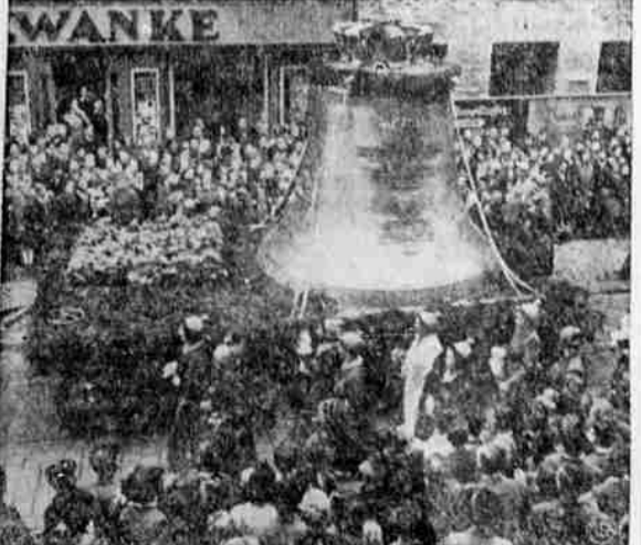
"BIG PUMMERIN" RINGS AGAIN —Re-cast 20-ton "Big Pummerin," which rang from belfry of St. Stephen's Cathedral, Vienna, for more than 200 years, will sound again. Broken during fighting in 1945, the bell is carried in procession through Linz, Austria, en route to Vienna.

"Senate" originally meant an assembly of old men and the word derives from the same root as "senile."