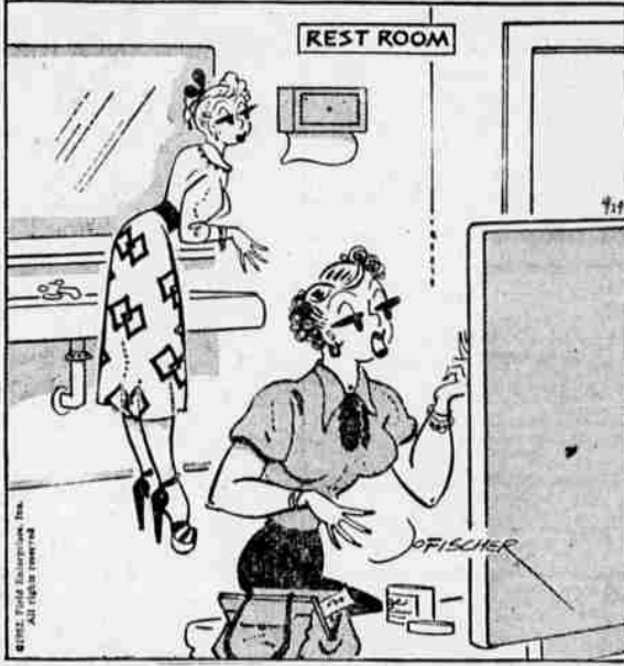
This new cold cream certainly is working, Dementia. I can't remember when my wrinkles looked so attractive.