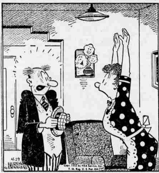
"I got into a political argument with my barber!"