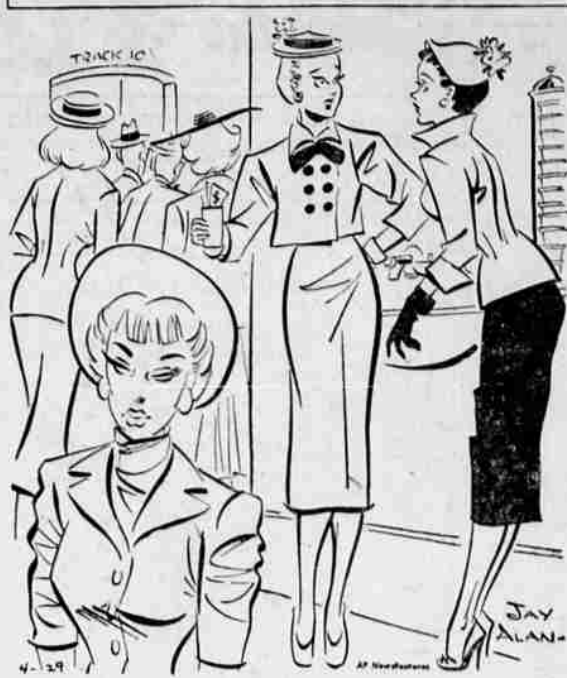
"I WAS JUST STANDING HERE WITH THIS CUP GETTING A DRINK OF WATER AND I GOT THREE DOLLARS AND FIFTY CENTS!"