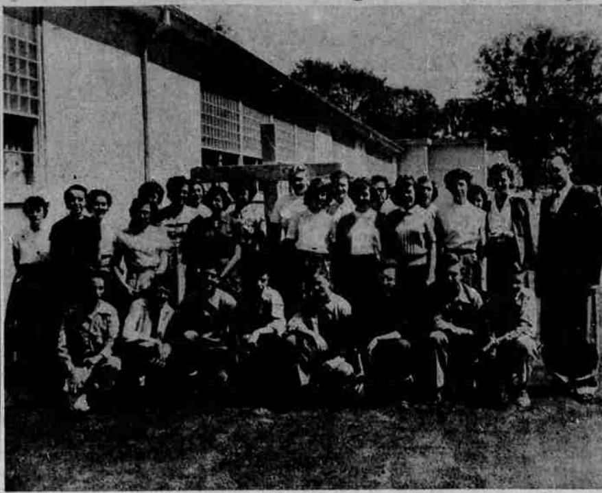
The Nu Delta (Christian Club) of the Senior High School presented the Easter program, "The Lives," in the school auditorium on Friday, April 11.

It consisted of three tableaux depicting four worshippers kneeling at the foot of a cross, the closed tomb under guard, and the open tomb with the angel and astounded women. Effective lighting helped to portray the true meaning and vividness of the Resurrection of Christ.