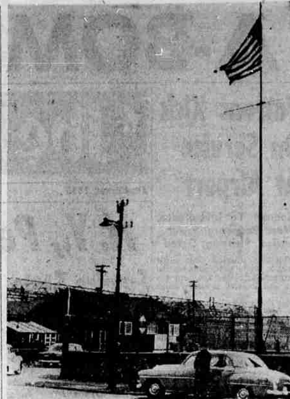
OLD GLORY OVER STEEL PLANT —The gates were open and the Stars and Stripes waves over the entrance of the U. S. Steel Company plant in South Chicago, Ill., as workers enter the grounds. President Truman seized the steel industry in the name of the United States to prevent the walkout of 650,000 steel workers.

SEWARD, Alaska (AP)—All three delegates from Alaska to the Republican National Convention at Chicago in July will be supporters of Sen. Taft.