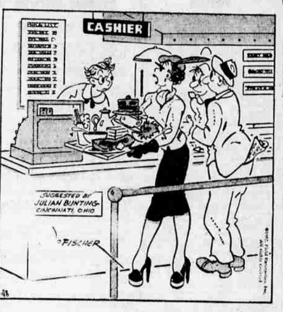
Will you have somebody put this stuff back? I've decided to go on a diet.