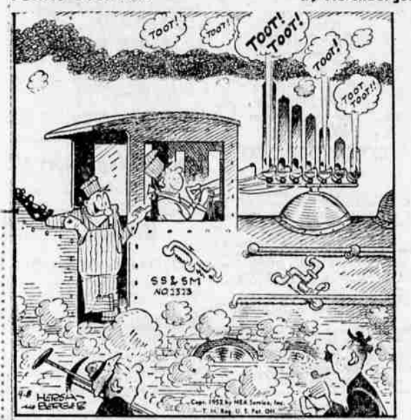
"He's crazy about music so he installed a calliope instead of the regular whistle!"