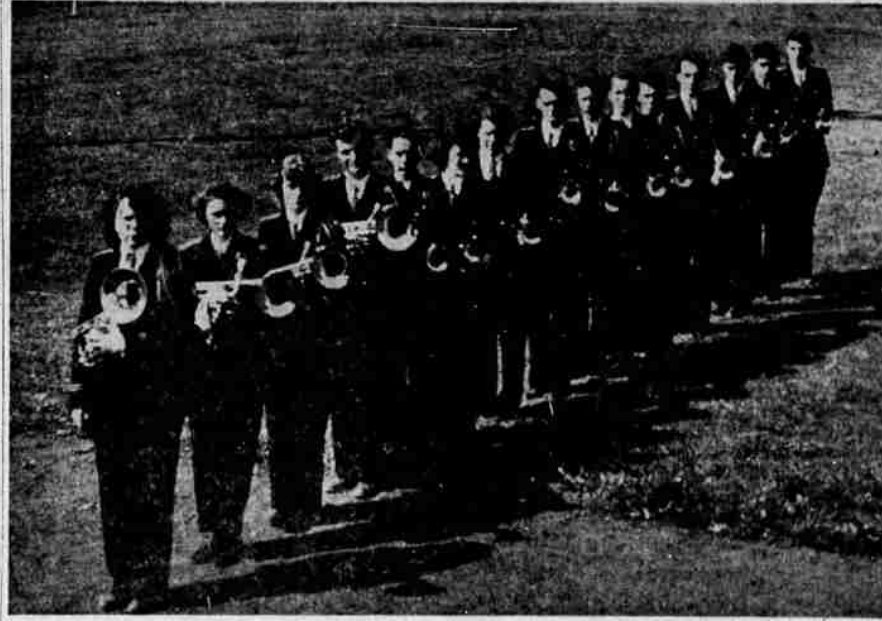
"REVIEW OF BANDS"—Pictured above are two band sections that will perform in the "Review of Bands" that will be presented Wednesday evening at 8:15 in the Senior High School auditorium. The heavy brass section of the senior band is shown in the top picture. It is composed of trombones, baritones and sousaphones. In the lower picture is the cornet and alto section.