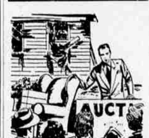
Going Going... GONE!