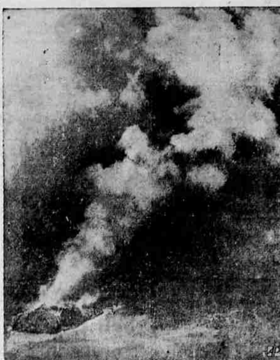
SUBMARINE VOLCANO ENDS 90-YEAR SLEEP —Smoke pours from the crater of a submarine volcano which suddenly came to life after a 90-year sleep and pushed a moving mass of volcanic rock (lower left) 250 feet above the surface of the Pacific Ocean, 315 miles north of Manila. It was estimated the column of smoke and steam towered 10,000 feet above the crater.