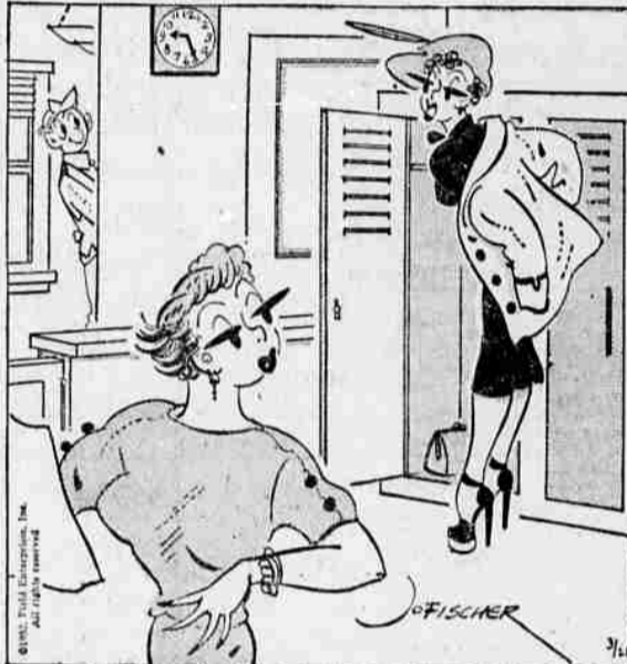
Well, Anchovy... here I am back to work. I did everything I could for my cold, but I got over it anyway.