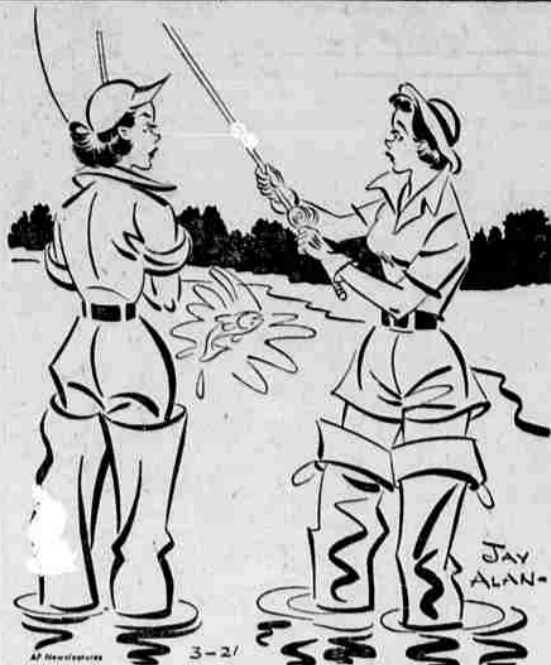
OH DEAR, NOW WHAT DO I DO? I DIDN'T DREAM I'D REALLY CATCH ONE!!