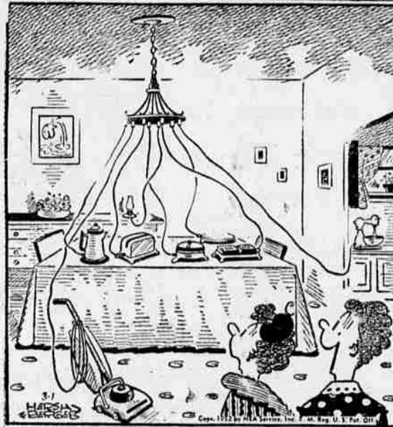
"With so many electrical accessories, we had our old chandelier re-installed!"