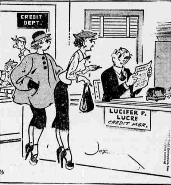
"We merely want a charge account as a convenience. We'd MUCH rather pay cash... if we had any."