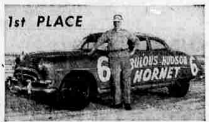
Marshall Teague with his fabulous Hudson Hornet just before blazing to his second consecutive victory in Hudson Hornets in the Daytona Beach Classic.

Without a pit stop, Marshall Teague brought his Hudson Hornet home first in the great stock car grind at Daytona, and Herb Thomas, also driving a Hudson, finished second! The secret of this Hudson success is flashing power, America's lowest center of gravity which hugs curves, and Hudson's ability to keep going without attention.