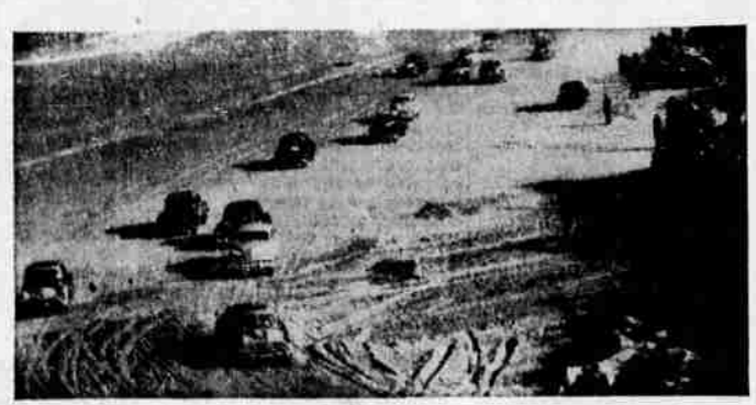
Experts say that 150 miles over the rugged Daytona Beach and highway course equal 50,000 miles of regular driving. Hudson durability pays off here—and for you in your daily driving.

1952 Hudson Hornets win 1st and 2nd in National Stock-Car Championship Race 150 MILE DAYTONA BEACH CLASSIC, FEBRUARY 10