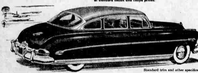
Fabulous HUDSON HORNET with Hudson-Aire Hardtop Styling at standard sedan and coupe prices.

These qualities are important to you, too. Whether you choose the Hudson Hornet, the Commodore, the Hudson Wasp, or the thrifty Pacemaker, you get eager power and winning stamina, plus exclusive "step-down" design with the best road-ability and greatest safety in any car! Visit your Hudson dealer, or phone him to bring a '52 Hudson to your door without obligation.