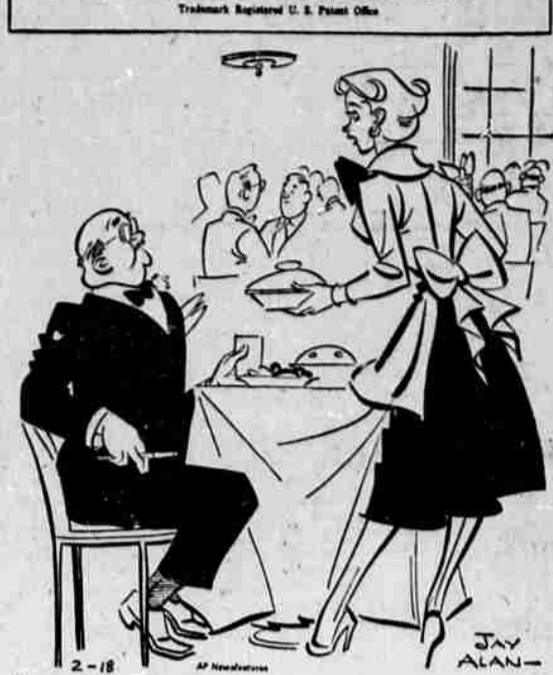
THE FOOD REALLY ISN'T SO BAD. IT'S JUST THAT WE HAVE SO MANY CUSTOMERS HERE TO COMPLAIN ABOUT IT!