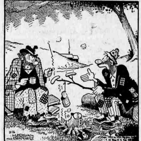
"So I looked the boss in the eye and said, 'Either I get a raise or I go!'"