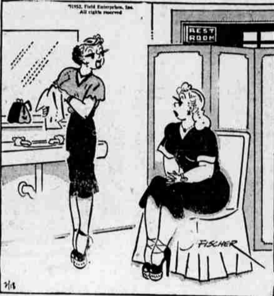
But Valise, darling . . . you must stop throwing yourself at men . . . especially when they aren't there.