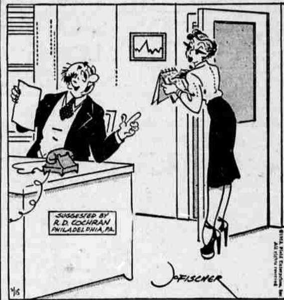
Make three carbons, Hysteria. One for the factory, one for our files and one to get lost.