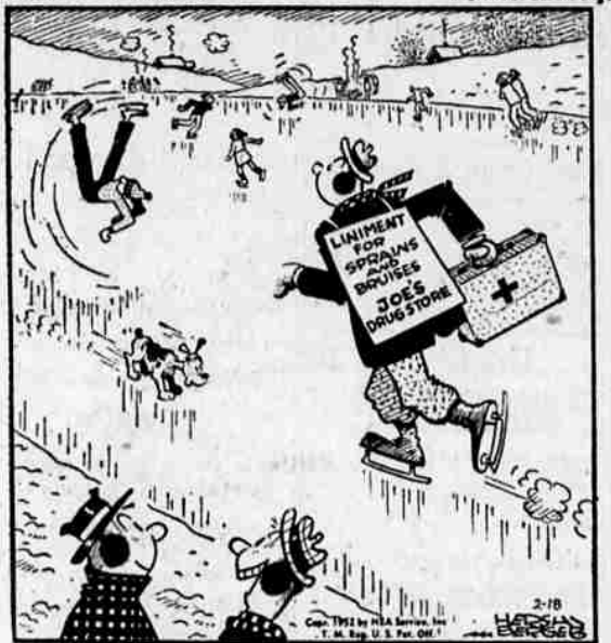
"He calls it his de luxe service!"