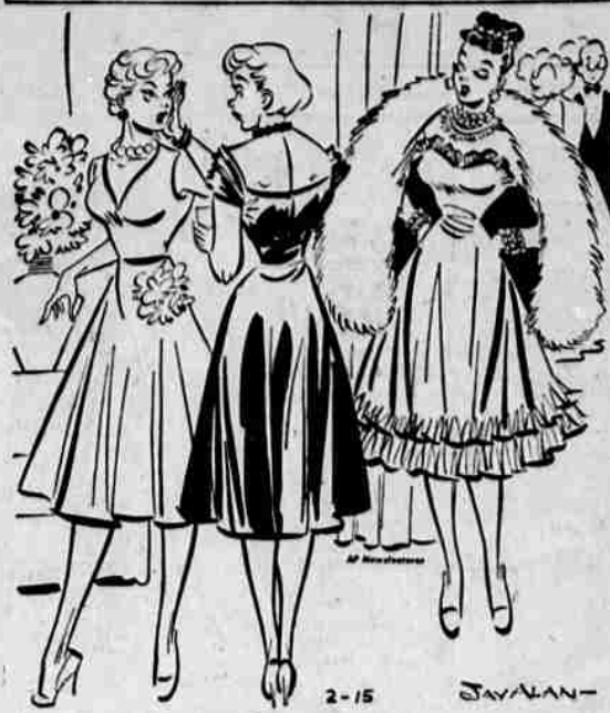
I DON'T LIKE HER AT ALL BUT I JUST HAD TO INVITE HER TO DRESS UP THE PARTY!