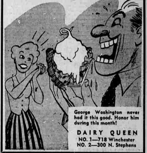
George Washington never had it this good. Honor him during this month!

DAIRY QUEEN NO. 1—718 Winchester NO. 2—300 N. Stephens