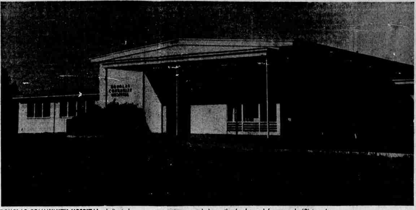
DOUGLAS COMMUNITY HOSPITAL, dedicated a year ago, is observing its first anniversary of successful operation. The above picture was taken from Harvard avenue at the hospital entrance and shows the landscaped foreground.