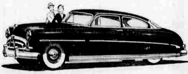
HUDSON WASP TWO-DOOR SEDAN IN HUDSON-AIRE HARDTOP STYLING

FOUR GREAT SERIES—with prices beginning near the lowest-cost field—Fabulous Hudson Hornet, Luxurious Commodore Eight and Six, Spectacular Hudson Wasp, Thrifty Pacemaker—all available with Hydra-Matic Drive. (Optional at extra cost.) Standard trim and other specifications and accessories subject to change without notice.