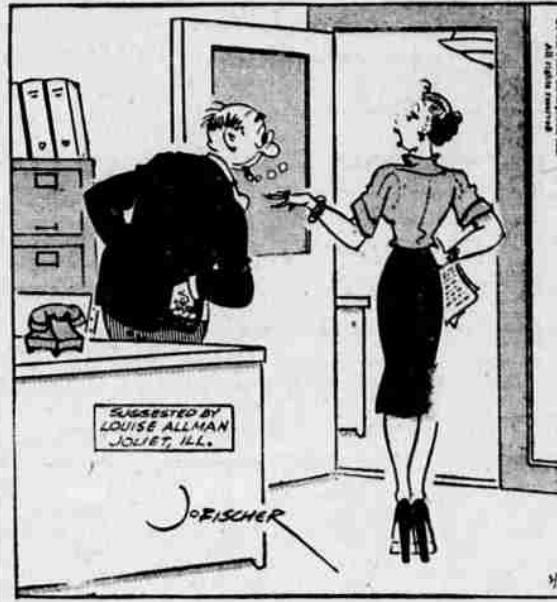
Isn't it lovely, Mr. Wump? I won't be working here much longer. Rancid has promised to marry me as soon as I get a raise.