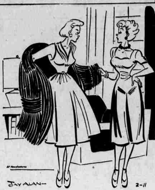
WHAT'D YOU SAY YOUR NEW COAT WAS, A MINX COAT?