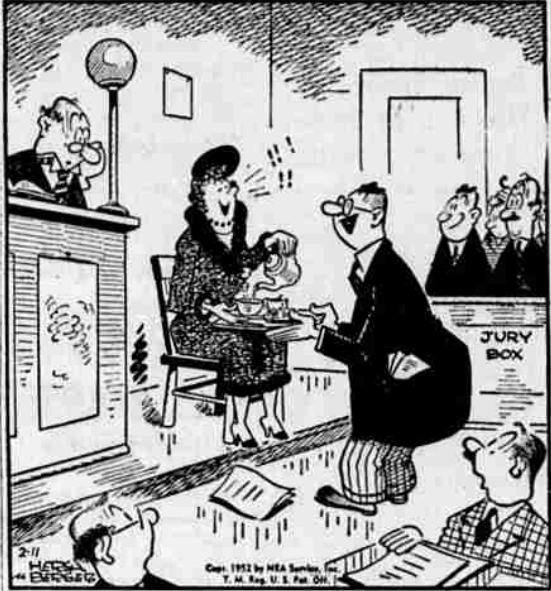
"My witness chats more readily over a cup of tea, your honor!"