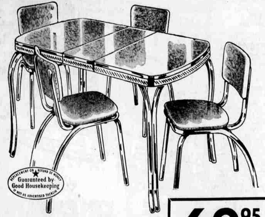
TABLE and 4 CHAIRS