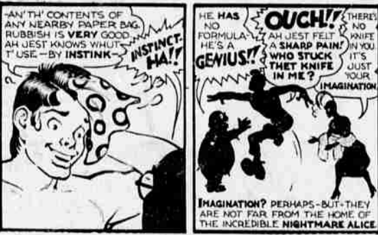
By Merrill Blosser