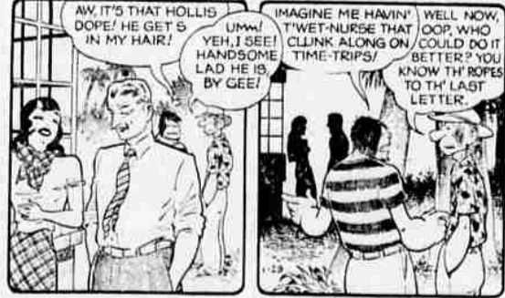
By Chic Young