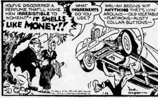
By Al Capp