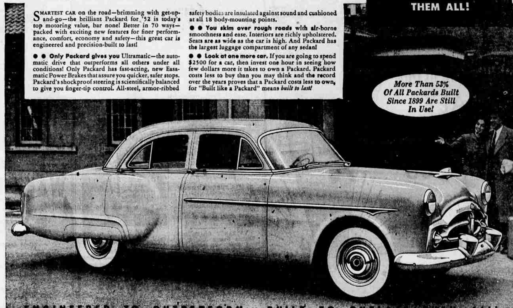
ENGINEERED TO OUTPERFORM - BUILT TO OUTLAST THEM ALL!