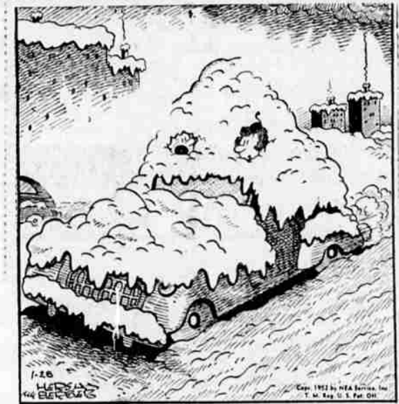
"I told you not to follow that automatic snow-loader so close!"