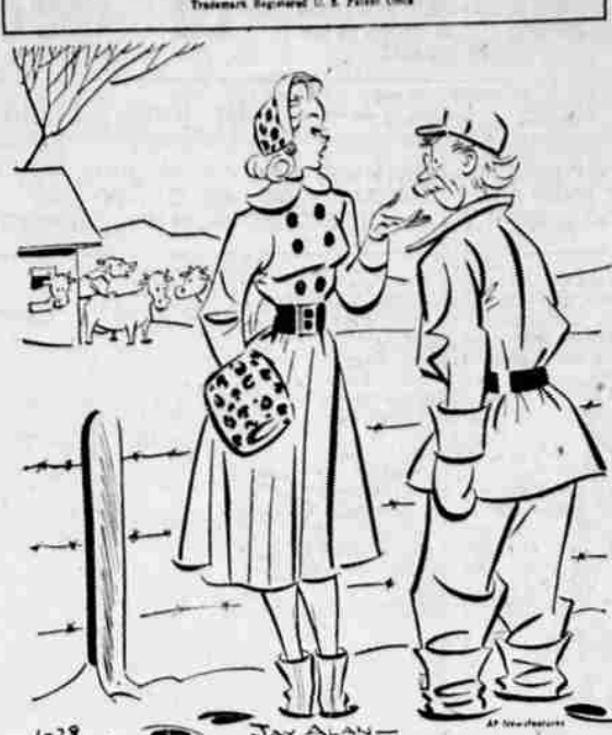
WHICH ARE THE REAL SMART ONES? THE ONES THAT GIVE HOMOGENIZED MILK!