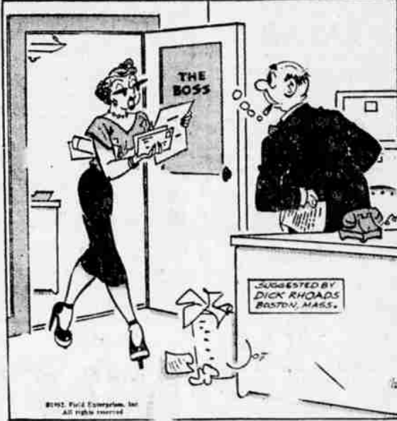
Here's today's mail, Mr. Wump... the stuff that come in last week.