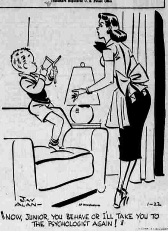
Now, Junior, you behave or I'll take you to the psychologist again!