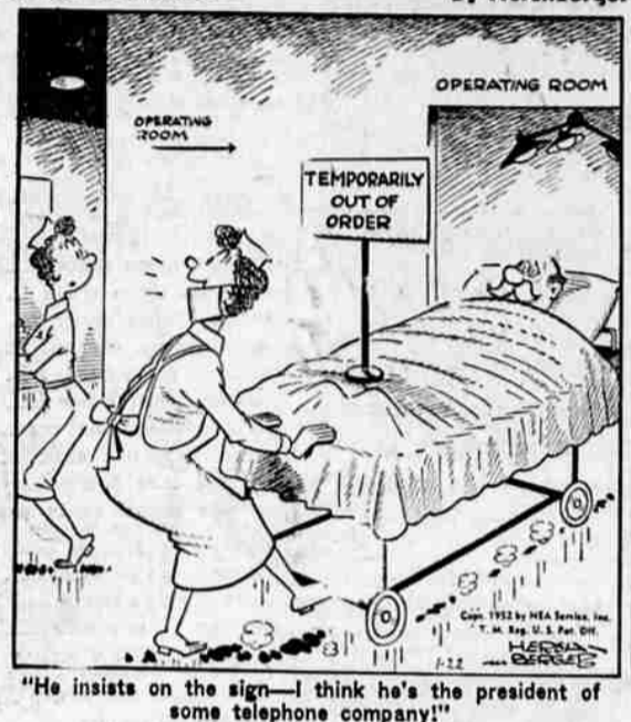
"He insists on the sign—I think he's the president of some telephone company!"