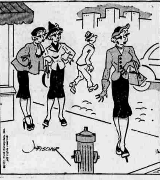
I couldn't possibly believe such a terrible thing about her. Hurry and tell me more.