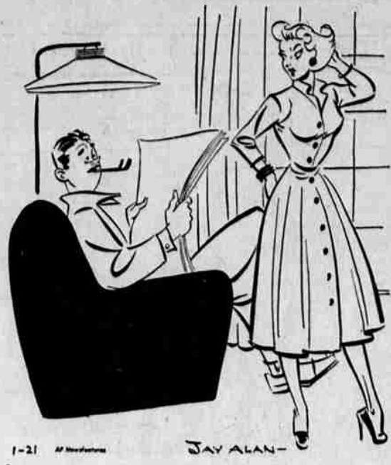
1-21 AP Newsphoto JAY ALAN "I WISH YOU'D STOP INTERRUPTING ME RIGHT IN THE MIDDLE OF AN INSULT!"