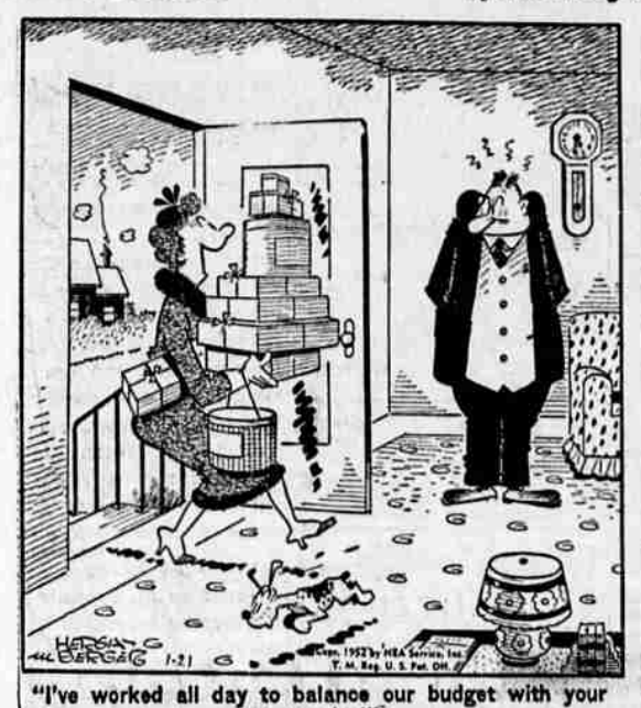
"I've worked all day to balance our budget with your new raise!"