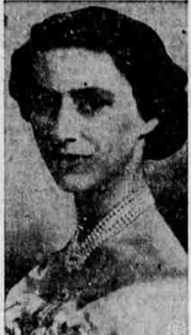
Princess Margaret Rose

ROYAL ENGAGEMENT AHEAD? A visit by the Earl of Dalkeith, 28, above, to Princess Margaret Rose at Sandringham, the King of England's private estate rekindled London rumors that announcement of a royal engagement may be expected soon. Dalkeith, heir to a fortune and most eligible young man in Britain, has been listed as a strong contender for the hand of the 21-year-old princess for the past three years. British observers noted a parallel between the royal family's gathering at Sandringham, with Dalkeith present, and the circumstances that saw engagement of Princess Elizabeth and Prince Philip four years ago. Princess Margaret insists she's in no hurry to wed, may wait until she is 25.