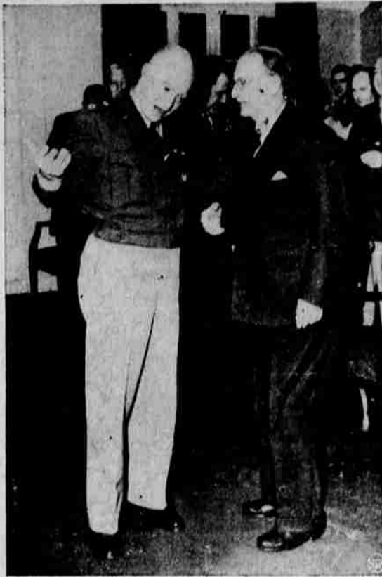
SOLD TO MR. DE GASPERI! —Gen. Dwight D. Eisenhower, supreme commander of NATO, gestures animatedly as he puts over a point to Italian Prime Minister Alcide De Gasperi. The meeting took place at Ike's SHAPE headquarters in Rocquencourt, France, where the subject of a six-power European army was discussed.