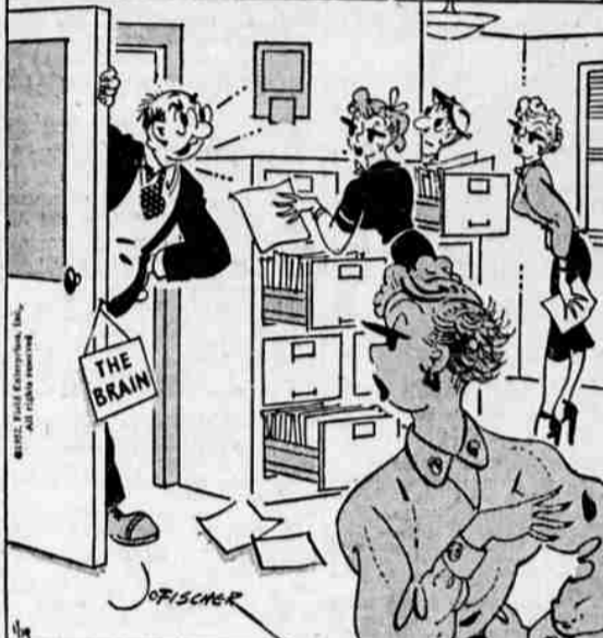
That piece of mind I just gave you was the wrong piece! I want you all to come back in here again!