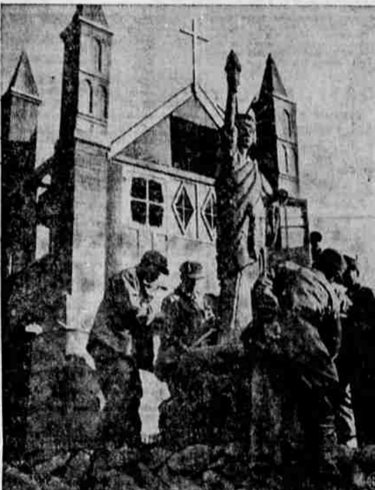
SYMBOLS OF LIBERTY — Communist prisoners-of-war at a United Nations stockade on Koje-do Island, off Pusan, put the finishing touches on a replica of the Statue of Liberty. They also built the model church in the background. These Red captives, who appear to have undergone a change in their beliefs, are among 132,000 prisoners at the camp.

WHAT WILL CONGRESS DO? —Congress is expected to move cautiously, if at all, through the legislative woods after reconvening this month. President Truman will probably get little that he seeks, except continued high military spending. Foreign aid is expected to find tough stalling, as will the President's expected request for higher taxes and his whole "Fair Deal" program. The Newschart above lists some of the major items before Congress. As in 1951, the legislative body is likely to continue to be most noteworthy for its investigations.